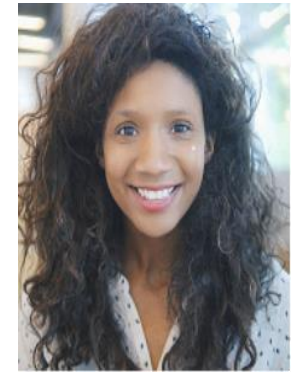
Jessica Biltmore Building