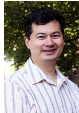
Kirk O'Keefe Building